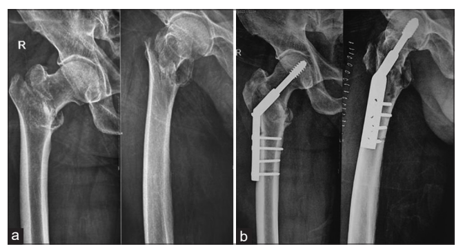
Figure 2: A 68-year-old male patient with intertrochanteric fracture fixed with dynamic hip screw. (a) Pre-operative radiograph. (b) Immediate post-operative radiograph.