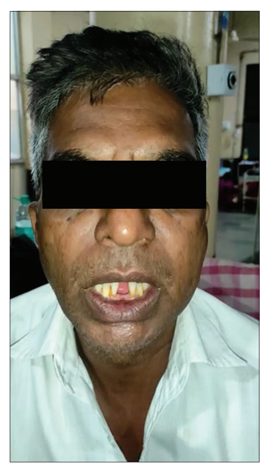
Figure 2: Opening mouth limitation to 1 finger.

A 48-year-old individual presented to the trauma unit at Karnataka Institute of Medical Sciences, Hubli, reporting a knife stab wound on the left cheek [Figure 1]. The incident had occurred 7 h before they arrived at the trauma department. They mentioned attempting unsuccessfully to remove the weapon by twisting the knife handle. During the extraoral examination, a knife was observed protruding from the patient's left cheek [Figure 2]. There was no active bleeding, and the patient's vision remained unaffected. The initial clinical assessment indicated no injury to the cranial area or