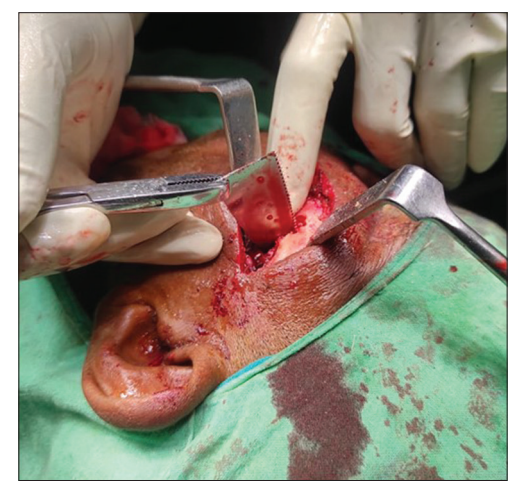
Figure 4: Wound debrided and cleaned with copious irrigation of iodine and saline.

Penetrating knife wounds are a common occurrence, necessitating a comprehensive clinical assessment of facial injuries. The cheek is frequently affected, with critical structures such as the facial nerve, parotid gland and parotid duct being of particular concern (Schultz and Oldham,