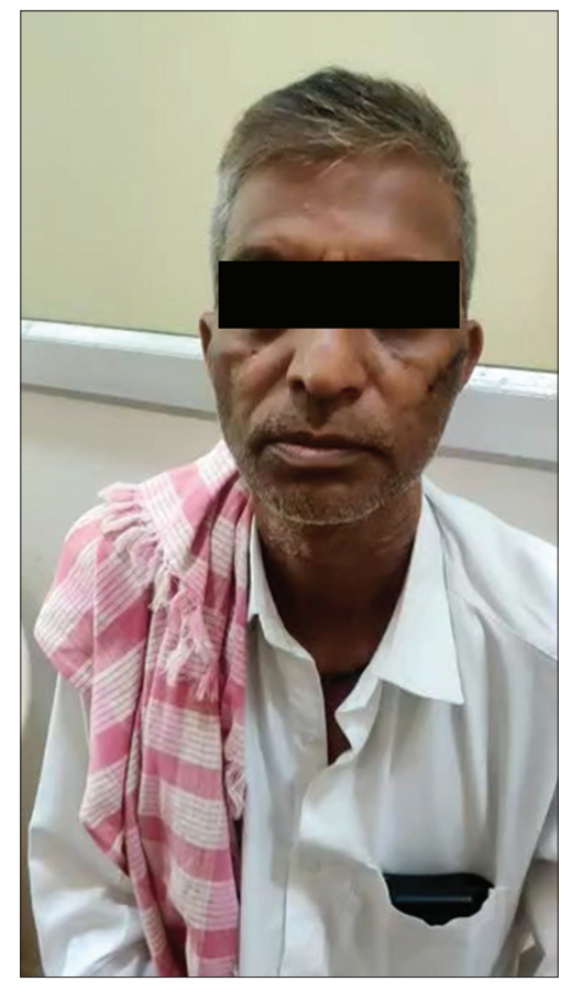
Figure 6: Post-operative picture (after 4 months).