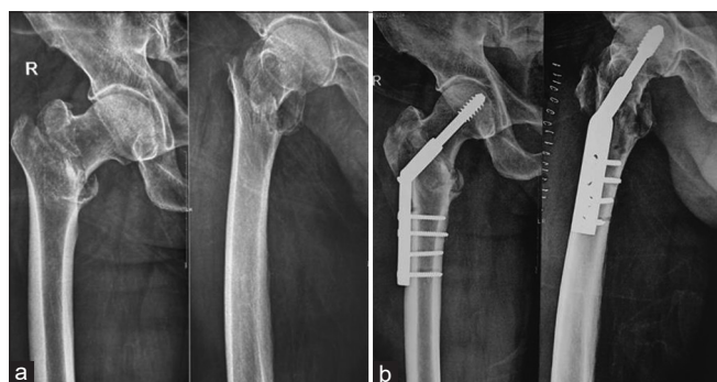
Figure 2: A 68-year-old male patient with intertrochanteric fracture fixed with dynamic hip screw. (a) Pre-operative radiograph. (b) Immediate post-operative radiograph.