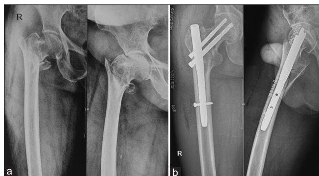
Figure 1: A 72-year-old female patient with intertrochanteric fracture fixed with proximal femur nail. (a) Pre-operative radiograph. (b) Immediate post-operative radiograph.

We conducted a prospective comparative study from October 2018 to March 2023 on patients with type II intertrochanteric fractures operated with closed/open reduction and internal fixation with either DHS or PFN [Figures 1 and 2]. A total of 60 patients have been included, out of which 30 belonged to group 1 and were operated with PFN, and the rest 30 were to