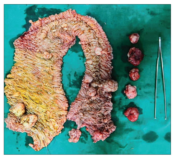
Figure 4: Resected ileal loop with multiple pedunculated and sessile polyps.