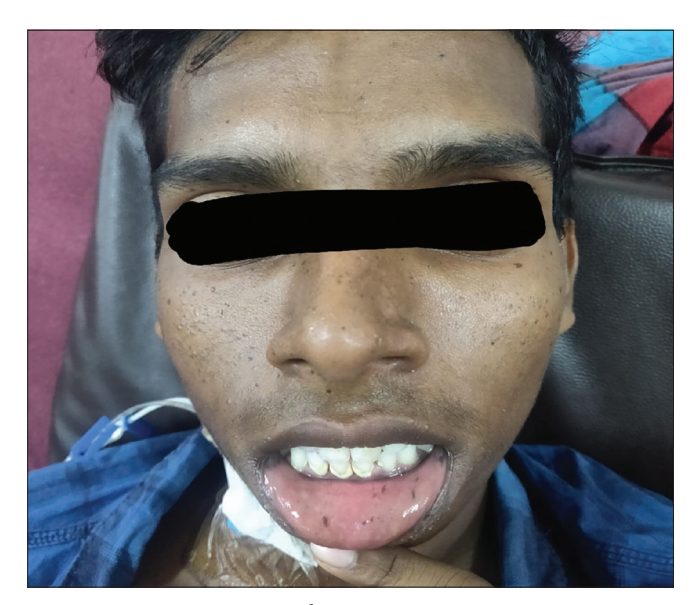
Figure 1: Mucocutaneous melanotic pigmentation.