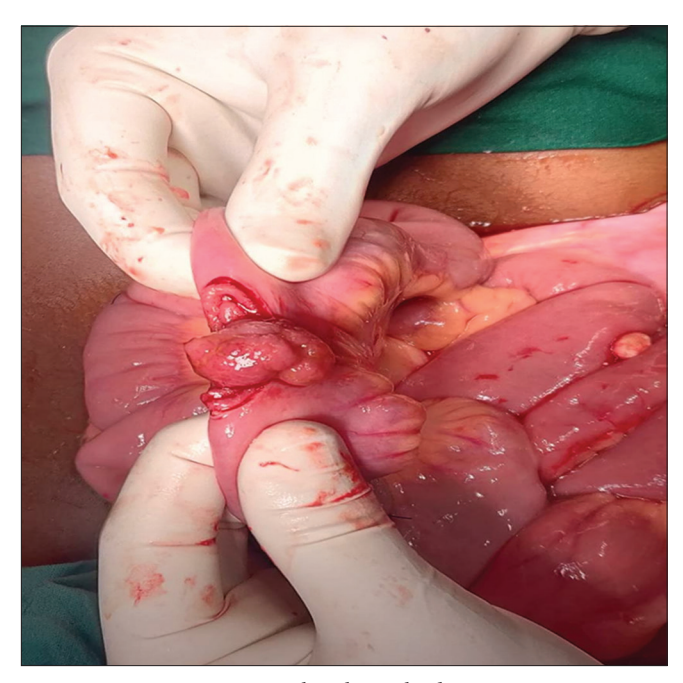
Figure 3: Intussusception with polyp as leading point.

Postoperatively, the patient's nutrition improved with blood transfusion and total parenteral nutrition. The patient was advised regular follow-up, colonoscopy and screening of family members.