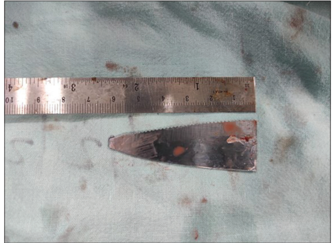
Figure 5: Foreign body removal.

1977). [6] In addition, consideration should be given to associated vascular damage, as indicated by signs such as active bleeding, an expanding haematoma, a bruit or a pulse deficit in the superficial temporal artery, all suggestive of penetrating vascular trauma.