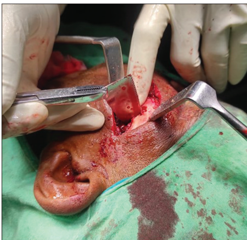
Figure 4: Wound debrided and cleaned with copious irrigation of iodine and saline.

Penetrating knife wounds are a common occurrence, necessitating a comprehensive clinical assessment of facial injuries. The cheek is frequently affected, with critical structures such as the facial nerve, parotid gland and parotid duct being of particular concern (Schultz and Oldham,