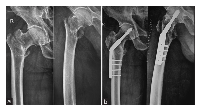
Figure 2: A 68-year-old male patient with intertrochanteric fracture fixed with dynamic hip screw. (a) Pre-operative radiograph. (b) Immediate post-operative radiograph.