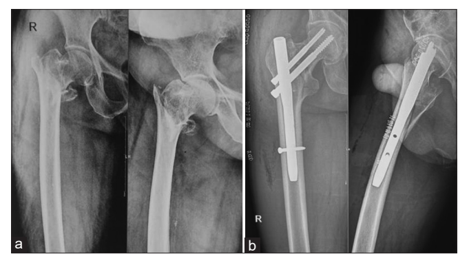
Figure 1: A 72-year-old female patient with intertrochanteric fracture fixed with proximal femur nail. (a) Pre-operative radiograph. (b) Immediate post-operative radiograph.

We conducted a prospective comparative study from October 2018 to March 2023 on patients with type II intertrochanteric fractures operated with closed/open reduction and internal fixation with either DHS or PFN [Figures 1 and 2]. A total of 60 patients have been included, out of which 30 belonged to group 1 and were operated with PFN, and the rest 30 were to